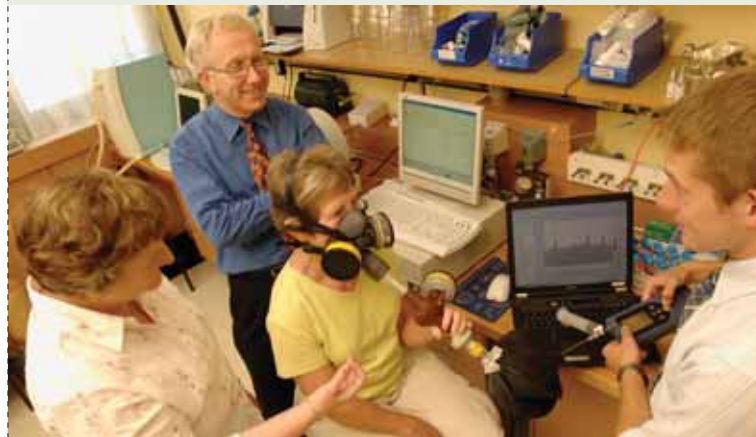
The Otago Respiratory Research Unit's leading edge research in the field of asthma has the medical world reviewing traditional asthma care.

The Health Research Office is the operational arm of the Research Advisory Group. It streamlines processes, facilitates effective communication, promotes safe research practices, manages relationships and provides support to researchers.