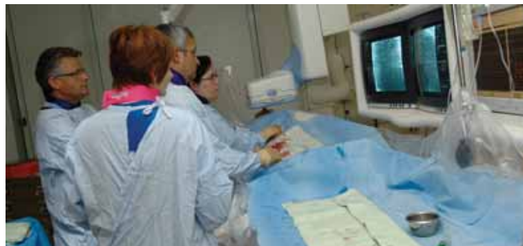
Over the last 20 years the Otago Cardiology Research Unit at Dunedin Hospital has been right at the forefront of life-saving research that has contributed to reducing the risk of dying from a heart attack from 15 to 20% down to 3 to 6%.