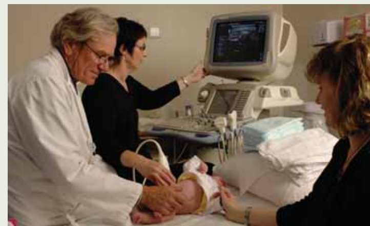
At Dunedin Hospital, a research study led by an orthopaedic surgeon that involved introducing an innovative screening programme, twenty years ago, has dramatically reduced the number of children requiring hip operations today.

If you would like to explore the opportunity to help grow the research capabilities of the Dunedin School of Medicine and the Southern District Health Board, the Health Research Office would welcome contact from you